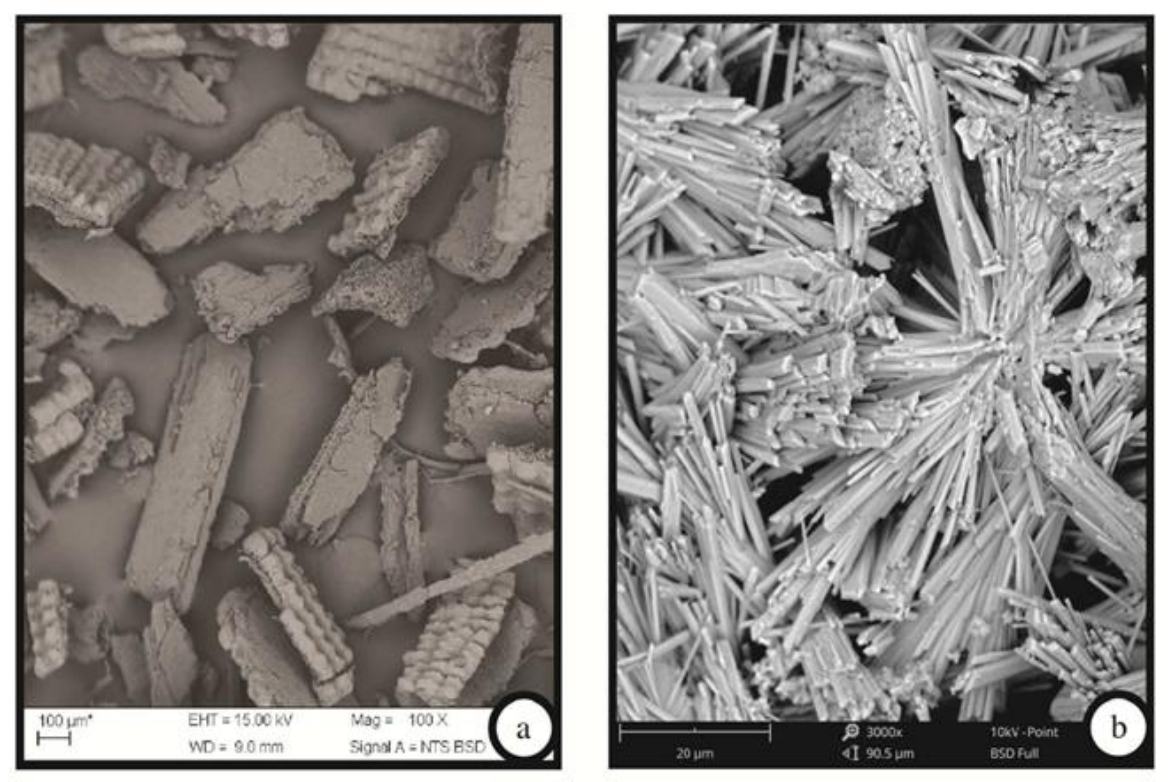
Fig. 1 - (a) rice husks after grinding process by UNIFEI MEV (b) gypsum crystals after their hydration by scanning electron microscopy by the bench MEV.

Micrographs were obtained using the Scanning Electron Microscopy (SEM) technique of fractions retained in sieves. The equipment used was the Zeiss EVO MA15 electronic microscope, located in the Structural Characterization Laboratory of the Institute of Mechanical Engineering (IEM) of the Federal University of Itajubá (UNIFEI) and also the Proac X-based anacom Scientific microscope. Samples were fixed with adhesive carbon tape, followed by metallization with gold and the electron detector was used to obtain the images, Figure 1.