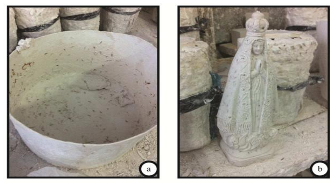
Fig. 3 - Mixture of composite (a) and artifacts developed with gypsum and in-nature rice husks (b) at JB company.

In general, artisans use an average of 2 kg of plaster to develop 4 saints that are sold at a price of R$ 3,50 per unit (approximately US$ 1.00). The use of plaster weekly by the company is 10 bags of 40 kg each, totaling 400 kg of plaster per week. The total rent in the relation between use of plaster and the commercialized images is on average R$ 2.800,00 reais per week (approximately US$ 760.00). In order to evaluate the possible reductions in gypsum consumption and, therefore, the savings generated in the process, a comparison was made between the traditional process used by the artisans (pure gypsum) and the alternative, using the material proposed in the present study (added plaster of rice husks), Figure 3.